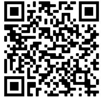
Transfer Course Approval Form